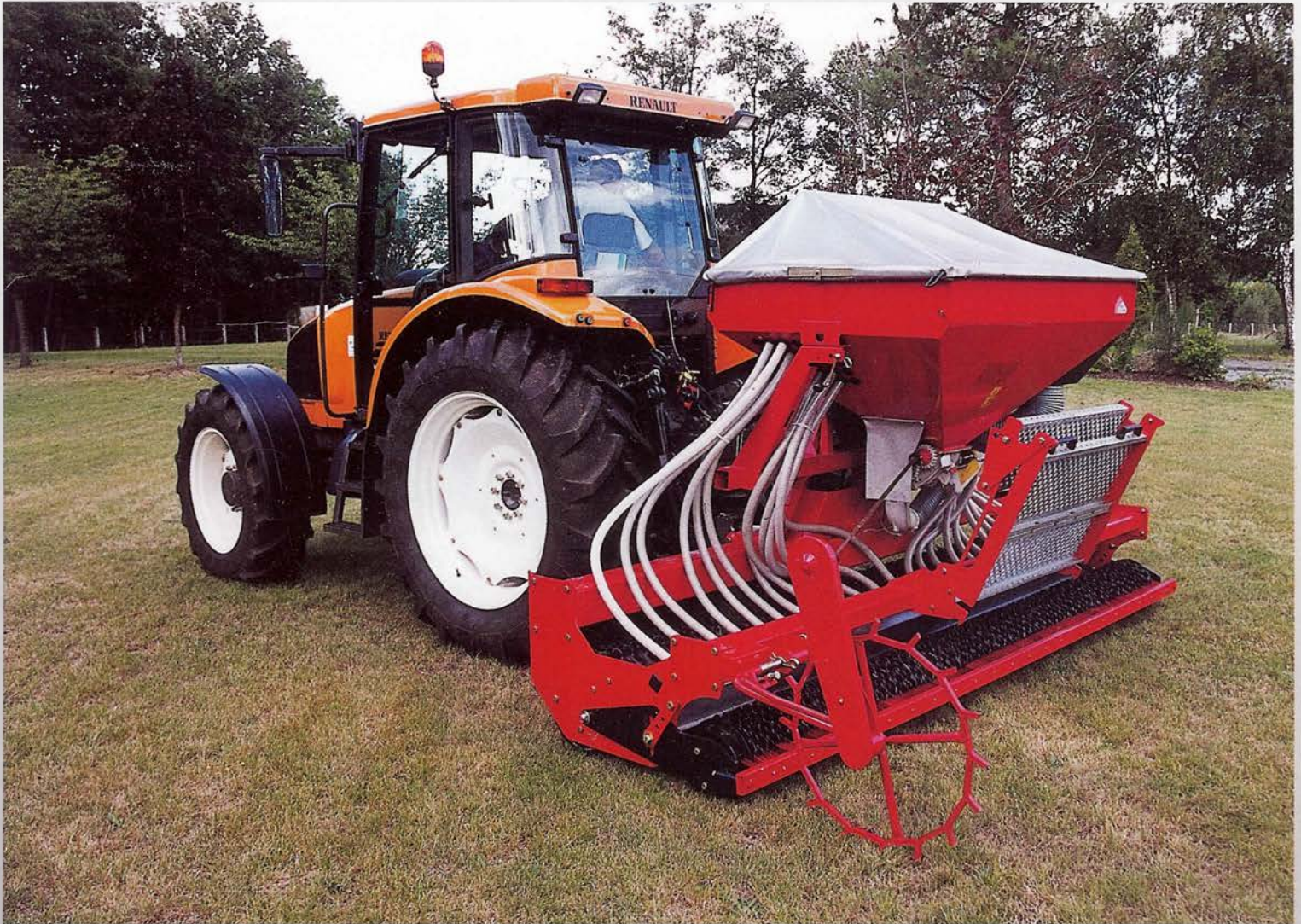
SMA 305 Primary Pneumatic Seeder notched rollers