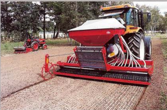
PRIMARY Pneumatic SEEDER