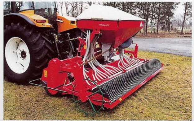
RotaDairon RX 220/250/300/400 Soil Renovator+ SMA Pneumatic seeder = Combi-Seeder RotaDairon RMA