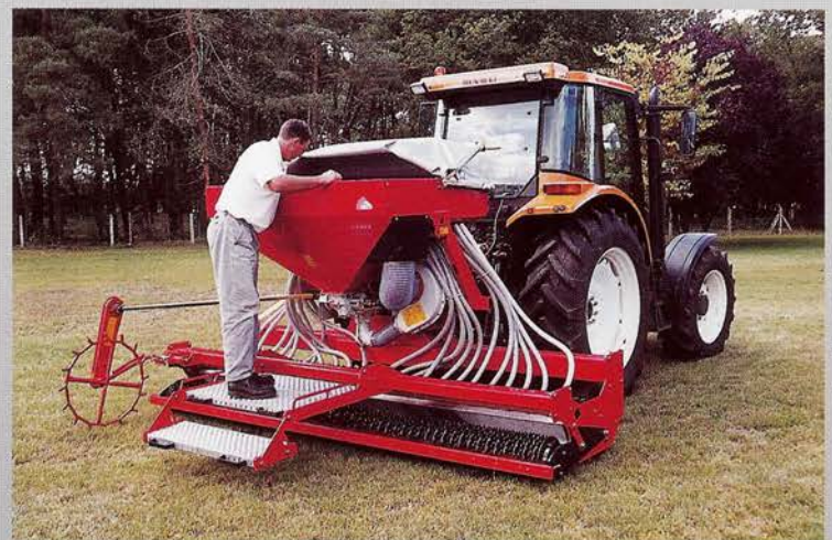
Platform on SMA 305 & 405 Primary Seeder for easy loading Floating rear roller ensuring consistent seed/soil contact